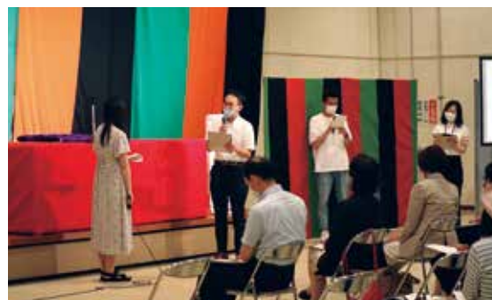
A Yasashii Nihongo skit. In pairs of Japanese and foreign residents, they performed skits about everyday life, such as helping someone who is lost.