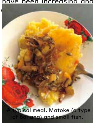
A typical meal. Matoke (a type of banana) and small fish.