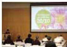
October 23 rd , Niigata City