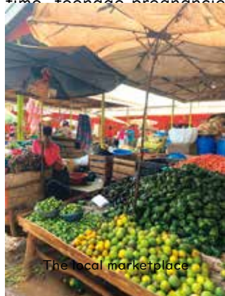
The local marketplace