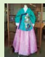
Korean ethnic clothing