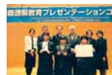
HS Division First Place - Cacao