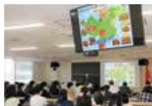
November 3 rd , Tainai City