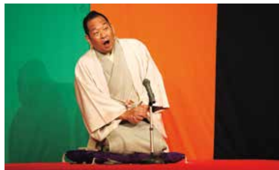
By changing his voice, he could perform multiple roles by himself.