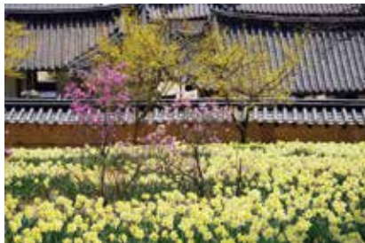
Korean Azaleas and Goldenbells

In Japan, there is a strong image that "spring = cherry blossoms," but in Korea, we think of cute pink "Jindalrae" (Korean azaleas) and yellow "gaenari" (Korean goldenbell) flowers. According to the old calendars, March 3 rd was traditionally a good day for going out and seeing flowers. People would eat and have a picnic with "hwajeon" (화전), a Korean chijimi pancake with bloomed azaleas, while enjoying "hwajeon nori" (화전놀이). This is the Korean version of "hanami," or "flower viewing" in English. If you have the chance to go to Korea, definitely try "hwajeon nori"!