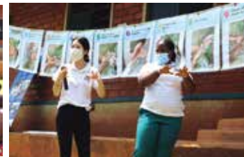
An event to promote hand-washing. We visited schools to teach students and their guardians proper hand-washing methods.