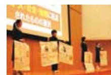
JHS Division First Place - Go! Ecotto