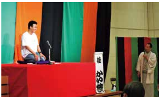
Giving Yasashii Nihongo rakugo a try. The students sat on the stage and performed using stories from Kaishi.