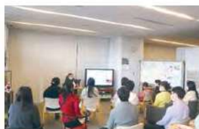
At the Lecture

Then, the many exchange students really livened up the event. They helped set up and manage the entrance, and they even made panels showing "Women Active in the World"!