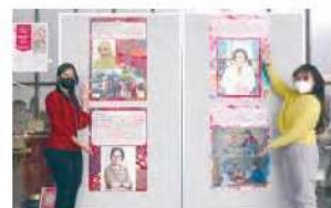
Exchange Students at the Fair