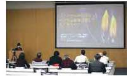
An event held last FY

Seminars for deepening cultural understanding will be held throughout the prefecture, where you can learn about the history, society and culture of countries that have close ties with Niigata Prefecture. So that many people can participate, there are also seminars that are held online, so please feel free to join in.