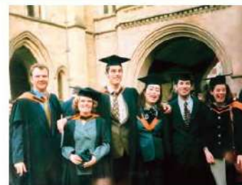
Graduate School Commencement Ceremony

I left JICA in 2020, and began my dream life in a thatched-roof home in Niigata. While fighting against the everyday weeds and bugs, I started working at JICA's Niigata Desk from May, 2022.