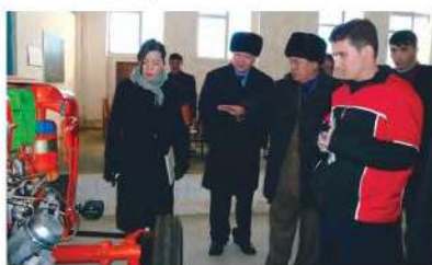
Inspection trip to Uzbekistan

Until now, I have been involved in a reconstruction assistance project led by the late former JICA President Ogata Sadako, in which ethnic groups that were at odds with each other during their civil war worked together with Japanese third parties to restore agricultural production bases and technologies damaged by the war, with the aim of restoring economic activity and fostering mutual trust among the ethnic groups. In Peru, where I was posted overseas, I also provided emergency assistance during the major earthquake that occurred off the coast of Peru shortly after my arrival, and I worked with the then-newly established Peruvian Ministry of Environment on waste management issues. At the same time, I was engaged in a project to introduce integrated waste management to local cities to improve waste collection systems and increase recycling, while building 31 new sanitary landfills nationwide, up from four.