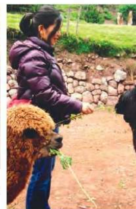
Right : Baby alpacas in the Andes