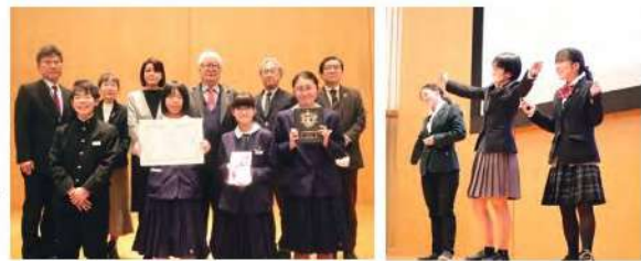
2021's Presentation Contest

※ For details, please visit our homepage using the QR code