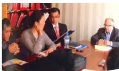
Meeting in Peru

JICA is the executing agency of the government of Japan's Official Development Assistance (ODA). In order to realize human security and high quality growth in