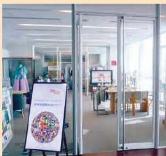
Spacious and Comfortable

The Consulate General of the Republic of Korea in Niigata graciously donated Korean national costumes and a panel of traditional patterns to our organization, which we now have on display in our Korean Corner.