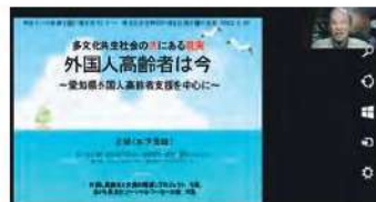
At the Medical Seminar

On this day, besides foreign resident support groups, participants from various fields such as those involved in medical institutions and welfare organizations also joined and showed a high level of interest.