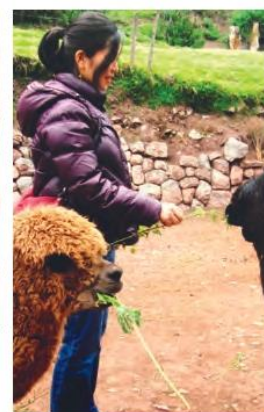
Right : Baby alpacas in the Andes