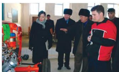
Inspection trip to Uzbekistan

Until now, I have been involved in a reconstruction assistance project led by the late former JICA President Ogata Sadako, in which ethnic groups that were at odds with each other during their civil war worked together with Japanese third parties to restore agricultural production bases and technologies damaged by the war, with the aim of restoring economic activity and fostering mutual trust among the ethnic groups. In Peru, where I was posted overseas, I also provided emergency assistance during the major earthquake that occurred off the coast of Peru shortly after my arrival, and I worked with the then-newly established Peruvian Ministry of Environment on waste management issues. At the same time, I was engaged in a project to introduce integrated waste management to local cities to improve waste collection systems and increase recycling, while building 31 new sanitary landfills nationwide, up from four.