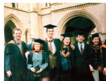
Graduate School Commencement Ceremony

I left JICA in 2020, and began my dream life in a thatched-roof home in Niigata. While fighting against the everyday weeds and bugs, I started working at JICA's Niigata Desk from May, 2022.