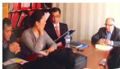
Meeting in Peru

JICA is the executing agency of the government of Japan's Official Development Assistance (ODA). In order to realize human security and high quality growth in