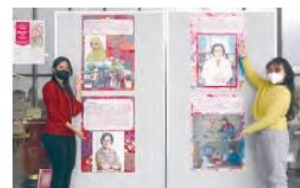
Exchange Students at the Fair