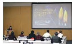
An event held last FY

Seminars for deepening cultural understanding will be held throughout the prefecture, where you can learn about the history, society and culture of countries that have close ties with Niigata Prefecture. So that many people can participate, there are also seminars that are held online, so please feel free to join in.