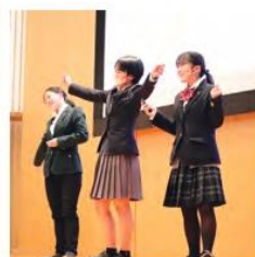
2021's Presentation Contest