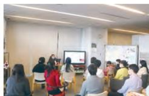
At the Lecture

Then, the many exchange students really livened up the event. They helped set up and manage the entrance, and they even made panels showing "Women Active in the World"!