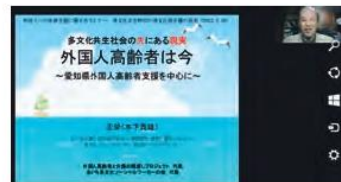
At the Medical Seminar

On this day, besides foreign resident support groups, participants from various fields such as those involved in medical institutions and welfare organizations also joined and showed a high level of interest.