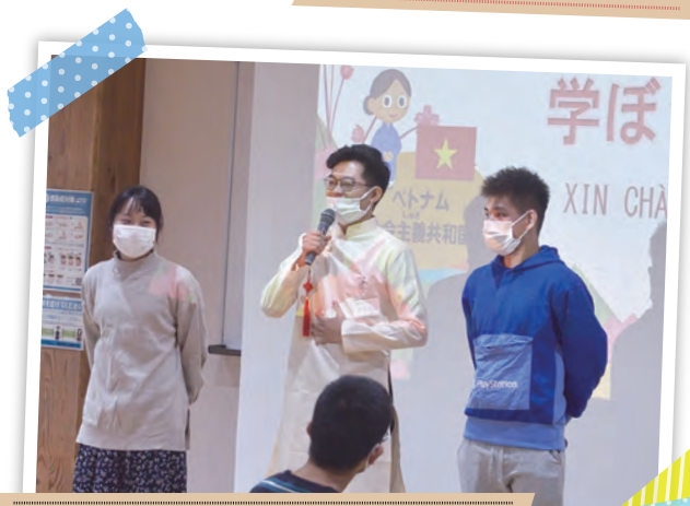
Exchange Student Representatives introduce their home countries to junior high school students (Tainai City)