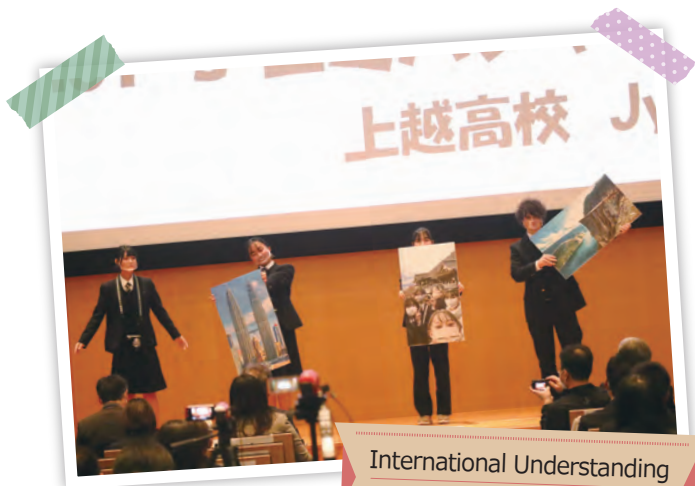
International Understanding Presentation Contest 2022