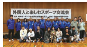
November 20 (Holiday, Sun.), 2022 Sports Exchange with Foreign Residents