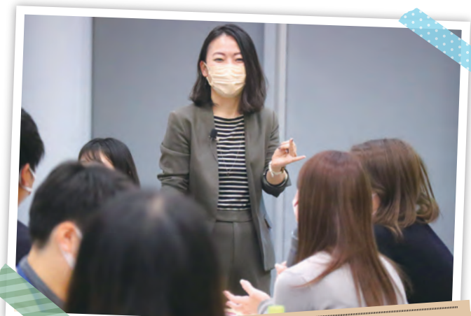
At a Yasashii Nihongo Seminar (Kashiwazaki City)