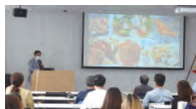
October 15 (Sat.) 2022, Niigata Venue