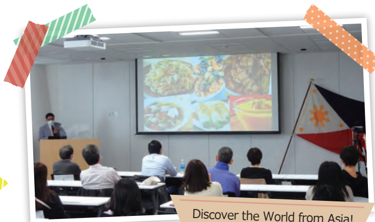
Discover the World from Asia! (Niigata City)