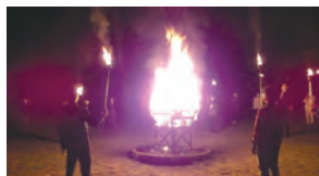
October 8 (Sat.) and 9 (Sun.), 2022 International Exchange Camp 2022

Main locations: Elementary, junior high and high schools, local governments, international associations, etc.