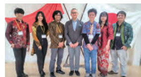
November 3 (Thurs.) 2022, Tainai Venue